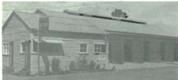
The main workshop building about 1965. This building constructed in 1912 was used as the coach house. The coach house doors shown were replaced shortly afterwards by roller doors.

In 1952, the workshop became known as the RMC Workshop, RAEME and reached at one stage a maximum strength of 85. In those days, trade repair resources were virtually non-existent in Canberra thus requiring all work to be carried out within the College Workshop.