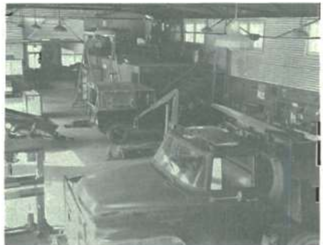
The interior of the coach house as it is today.

There are clearly some prominent names on the list of former OCs, including our own Larry Foley!