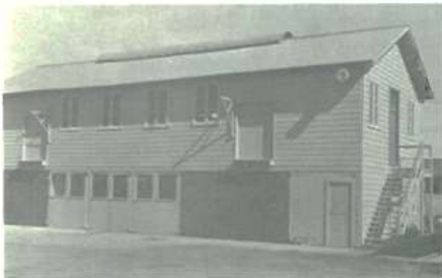
Hay loft and Saddlery store which were built in 1912. Building ground floor is now used as the electrical and telecom repair shop. Up until 1974, the upper floor was used as an instrument repair section.

Between 1947 and 1950, there was considerable debate as to whether the workshop should be a separate sub-unit or part of the college establishment. In 1947 the workshop was taken onto RMC strength. In 1948 it was separated and again in 1950 came under command of RMC instead of being attached.